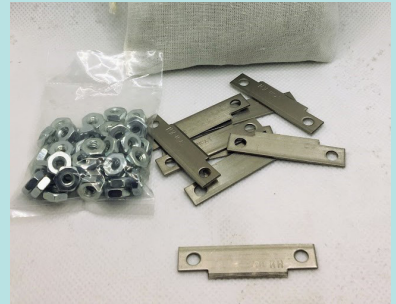
KH blade | 44.00.93025

The debeaker is manually operated. A metal foot pedal is available for easy operation.