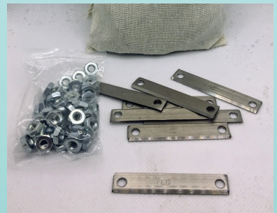
BC blade | 44.00.93000