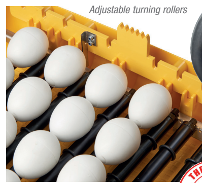
Adjustable turning rollers

Brinsea's Induced Dual Airflow system represents a breakthrough in incubator design and achieves new levels of temperature consistency for optimum incubation conditions.