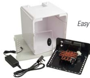
Easy clean cabinet designs