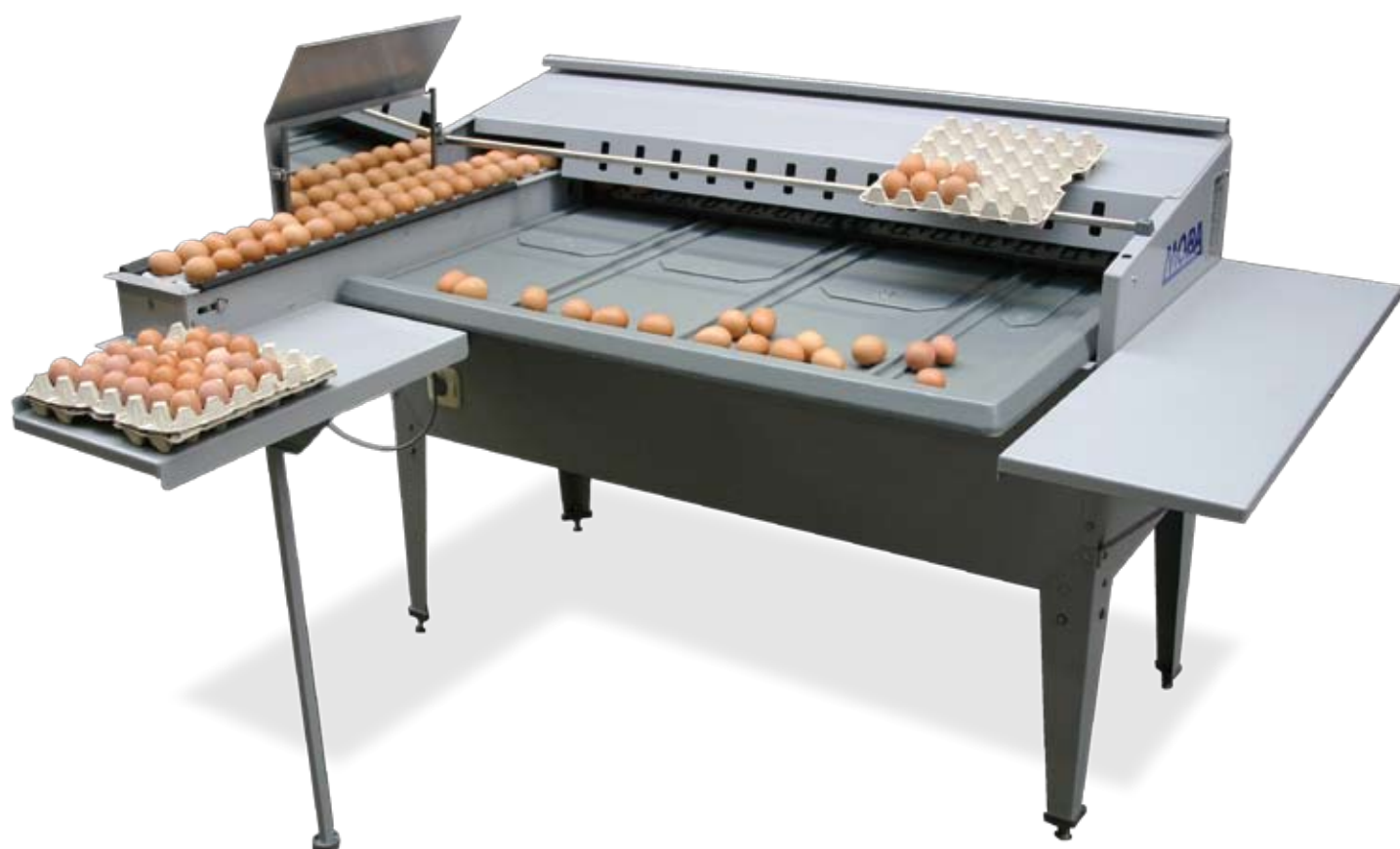
Moba 68 / Moba 88